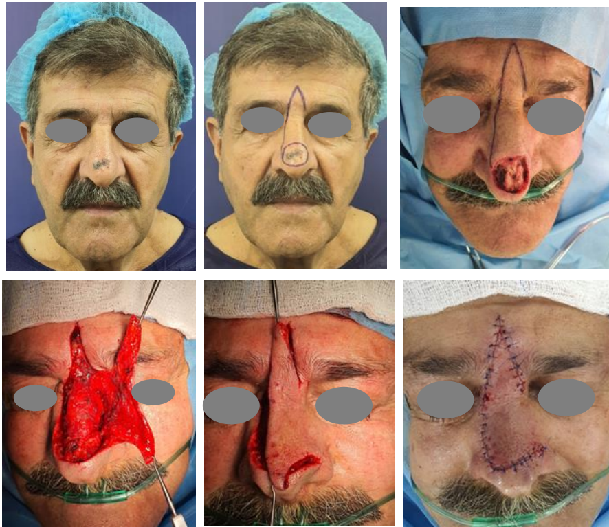
Figure( 2). Steps of surgical procedure for dorsal nasal flap, A: Patient with Basal cell carcinoma BCC on tip of the nose B: Pre-operative marking, C: After excision of skin tumor, D: Elevation of flap, E: Flap inset, F: Immediate post-operative picture.

The study was approved by the ethical committee of Kurdistan Board for Medical Specialties